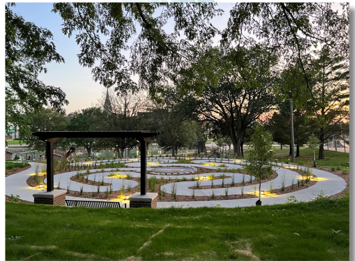
The Labyrinth at dusk with the steeple of Bishop Marty Chapel in the background.