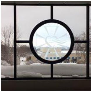
View from Sacred Heart Monastery