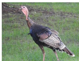
A resident Turkey at Sacred Heart Monastery