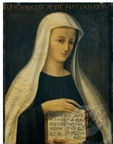
St. Frances of Rome (1384-1440)

God not only tested the patience of Francis with respect to her material wealth, but, as I have said before and will reiterate, he also tested her own body in a variety of ways, especially through long and serious illnesses which she had to undergo. And yet no one ever observed in her a tendency toward impatience. She never exhibited any displeasure when she complied with an order, no matter how foolish.