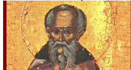
Melito of Sardis, Greek bishop (died c. 180)

Both the Law and the Word came forth from Zion and Jerusalem, but now the Law has given place to the Word, the old to the new. The commandment has become grace, the type a reality. The lamb has become a Son, the sheep a man, and man, God.