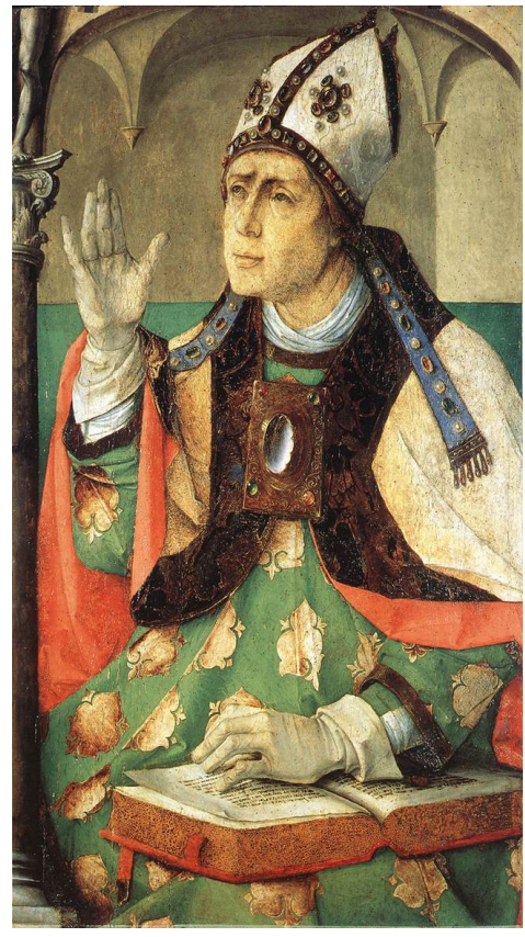
St. Augustine of Hippo by Joos van Wassenhove, 1474 Musée du Louvre. Paris

be praising God. You cease to praise God only when you swerve from justice and form what is pleasing to God. If you never turn aside from the good life, your tongue may be silent but vour actions will cry aloud, and God will perceive your intentions; for as our ears hear each other's voices. so do God's ears hear our thoughts.