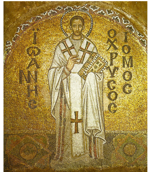
Source: Byzantine mosaic, AD c. 1000, Cathedral of the Hagia Sophia, Istanbul, Turkey

Source: From a homily by Saint John Chrysostom, bishop and doctor of the Church (AD c. 349–407)