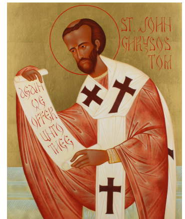
St. John Chrysostom

Prayer and converse with God is a supreme good; it is a partnership and union with God. As the eyes of the body are enlightened when they see light, so our spirit when it is intent on God, is illumined by his infinite light. I do not mean the prayer of outward observance but prayer from the heart, not confined to fixed times or periods but continuous throughout the day and night.