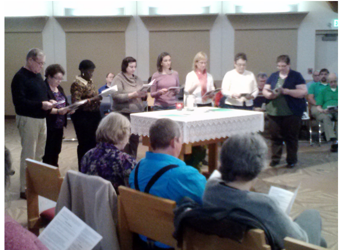
Eight novices made their initial oblations.